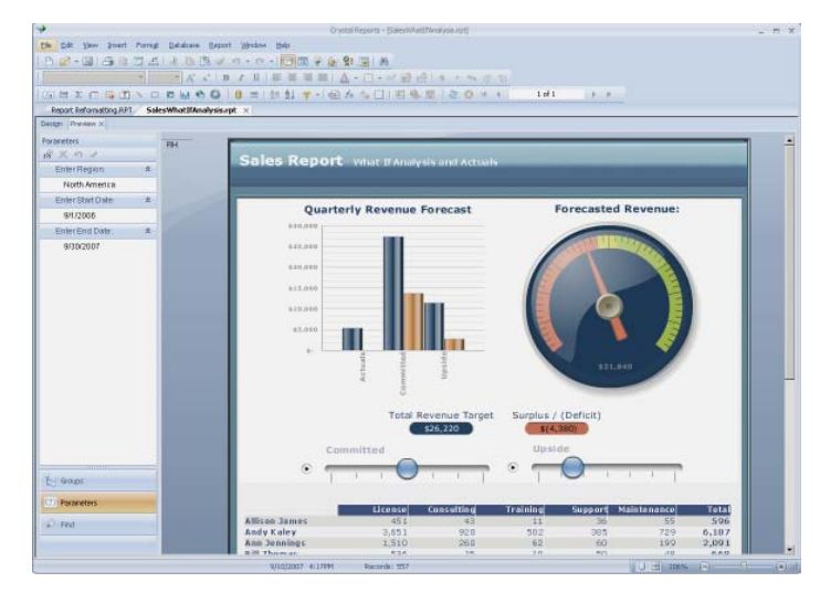
Figure 2: On-Report "What If" Scenario Modeling